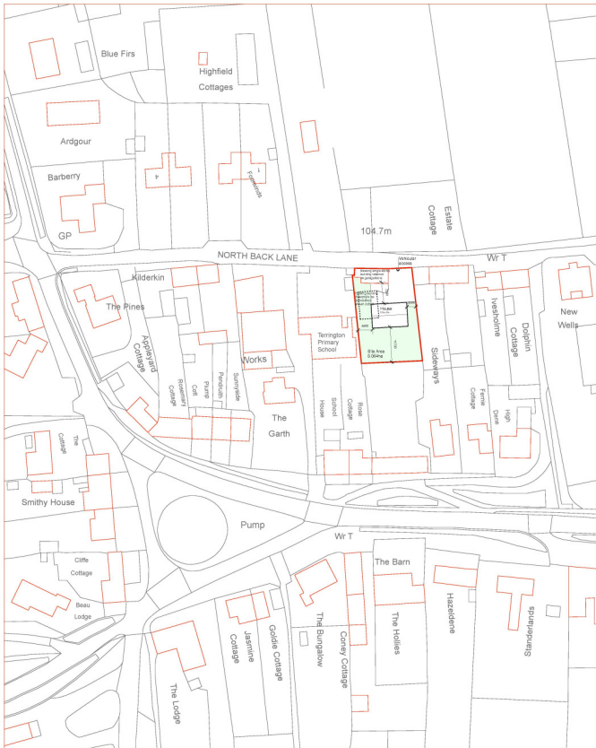
Site Layout 1:500