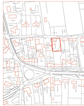
Location 1:2500 North Back Lane Terrington OS Grid Ref. 49875 70751 E 498751 N 470752

THIS DOCUMENT HAS BEEN PREPARED BY OR WITH THE ASSISTANCE OF THE CONSULTANT ENGINEER AND ARCHITECT AND IS NOT TO BE USED FOR ANY OTHER PURPOSE WITHOUT THE WRITTEN PERMISSION OF THE CONSULTANT ENGINEER.